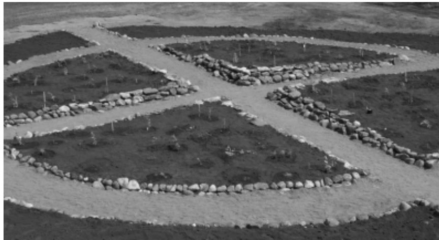
Figure 3: Day 6 the completed Medicine Wheel Garden, named by the tribal college students Pejuta Wakan Oju “Planting Sacred Medicine(s),” North Dakota.

plants are very young seedlings, only a few “pass away”; most thrive in the new garden. By late August, the students and Dr. Garrett have gathered and planted an additional two truckloads of native plants for the expansion of the garden and the development of the outer garden beds. In the future, they will create labels for the plants with corresponding descriptions of the Dakota name, taxonomic name and traditional uses. The goal is to provide a garden that demonstrates and teaches Dakota plant knowledge, provides traditional people access to these significant plants, and grows and expands with each new group of students and community members that assumes responsibility for the garden.