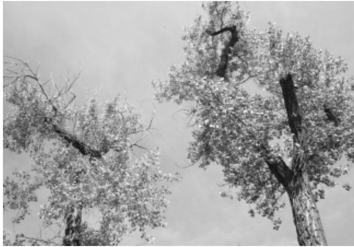
Figure 2: Photograph of Wága can “cottonwood” taken at Theodore Roosevelt National Park, North Dakota.

the proposed garden site and beginning preliminary work. After one hour, the first row of rocks that will define the four quadrants of the garden has been laid. The group breaks for lunch of soup, wojapi “fruit pudding”, and frybread provided by the tribal college. Many of the college faculty and staff attend. After lunch, when the actual physical work of the garden begins, a respected elder of the community blesses the construction of the garden. Then, the entire group continues working for about two and a half hours when an assessment of the progress is made. From the beginning of the outdoor work, everyone assumes a role and takes responsibility for a task(s). One of the tribal college students is surprised at the amount of work that is accomplished on the first day and comments, “I didn’t think so much would happen so fast.” A student from California comments that seeing “the vision come to life really seems to send a feeling of pride and acceptance through the people of our group.”