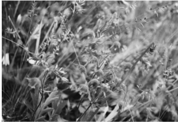
Figure 1: Photograph of Hokshi 'chekpa wahca “prairie smoke” taken at the International Peace Garden, Canada – USA, http://www.peacegarden.com/sights.htm .

and saying, “Good morning.” But the people passed them by unheeding. The flowers became abashed at this indifference, and so nowadays, still feeling friendly towards the people in spite of such rebuffs, they bashfully turn their heads to one side as they nod and call their kindly greetings in their low sweet voice. (as cited in Gilmore, 1987, p. 206)